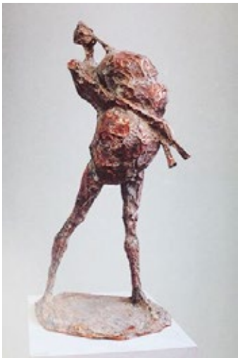
Figure 4. Dinu Rădulescu “Cimpoier” (“Bagpiper”), one of the numerous pieces in the art exhibitions at ARA 1992.