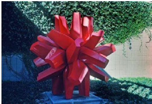
Figure 5. “Love Flower”/“Carpathian Flower” by Romanian-American sculptor/ceramist Patriciu Mateescu, CSUN Student Union Courtyard, 1985. There are three sister sculptures of it, one at UCLA Sunset Recreation Center (yellow), and one at Cedar Sinai Hospital, Beverly Hills (white), and the most recent one installed in the main square in the Bistrita town in Northern Romania (red; launched in 2016).